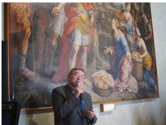
Figure 8 Professor Serge Kaliaguine giving a lecture on mesoporous titania-modified silicas as epoxidation catalysts at FineCat 2014, Palermo, Palazzo Steri, April 2, 2014.

On the same day, Serge Kaliaguine described the chemical behaviour of newly prepared Ti-SBA-15 silicas in epoxidation catalysis (Figure 8). [30]