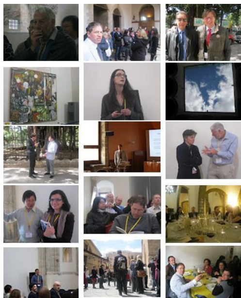
Figure 2 Snapshots from the first “FineCat-Symposium on heterogeneous catalysis for fine chemicals” held in Sicily, April 18–19, 2012.

unsophisticated approach for screening heterogeneous catalysts.