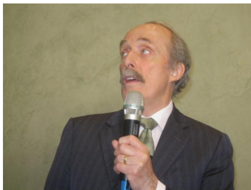
Figure 7 Professor David Cole-Hamilton giving a lecture on homogeneous and heterogeneous catalysis under flow at FineCat 2014, Palermo, Palazzo Steri, April 2, 2014.

Reactions covered included the hydroformylation of alkenes to give linear aldehydes, metathesis of methyl oleate, asymmetric hydrogenation to give a product which is a solvent free pure enantiomer and the first ever hydrogenation of amides to amines, [27] a particularly difficult reaction, of considerable interest in the pharmaceutical industry.