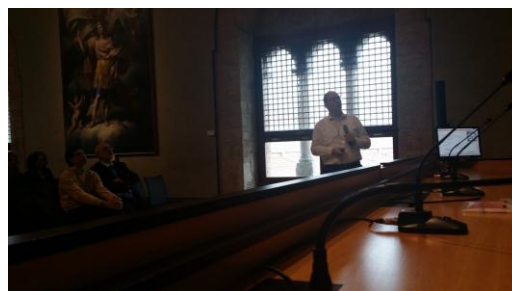
Figure 16 Professor Bert Sels giving a lecture on biomass conversion into valued molecules using Lewis acid catalysis with tin-modified silicas and zeolites at FineCat 2016, Palermo, April 7, 2016.

Professor Bert Sels in Katholieke Universiteit Leuven in Belgium, one of the world's leading chemistry scholars in biomass conversion into valued molecules, discussed how shape selective zeolites as well as zeolites and structured mesoporous silicas functionalized with single-site Sn catalytic centers tetrahedrally incorporated can be used as a highly effective heterogeneous Lewis acid catalysts in a wide range of sugar and other biomass-derived substrates conversions (Figure 16). [55]