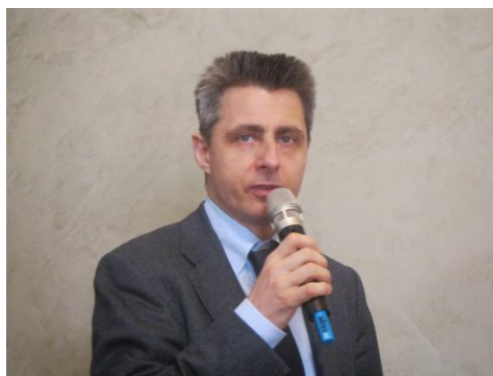
Figure 9 Professor Paolo Fornasiero lecturing on the design of cluster and nanocrystal catalysts as building blocks at FineCat 2014, Palermo, Palazzo Steri, April 3, 2014.

On the subsequent day, the Symposium was opened by University of Trieste's Professor Paolo Fornasiero, who described the nanochemistry approach to designing powerful catalysts by manipulation of clusters and nanocrystals as building blocks (Figure 9). [32]