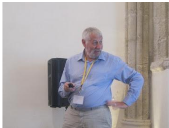
Figure 3 Professor Graham Hutchings giving a lecture on catalysis with gold and gold palladium nanoparticles at FineCat 2012, Palermo, April 18, 2012.

Anticipating subsequent advances in single-atom catalysis concerning also gold, [15] Professor Hutchings underlined how recent aberration-corrected microscopy studies on the nature of the active site for CO oxidation had revealed that the active species may involve only 7–10 gold atoms (Figure 3). [16]