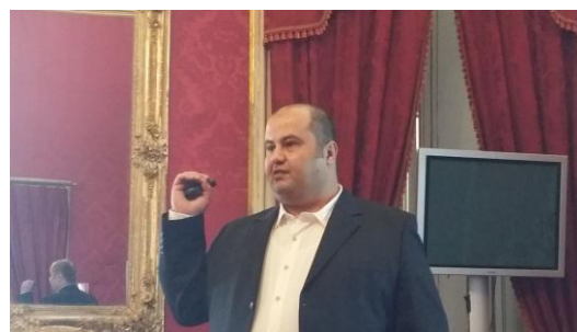
Figure 19 Professor Raed Abu-Reziq giving his lecture on nanostructured materials, nano- and microreactors as platform materials for heterogeneous catalysis at FineCat 2017, Palermo, Palazzo Reale, 5 April 2017.

In brief, Professor Abu-Reziq showed how ionic liquids (IL), polyethylene glycol (PEG) or deep eutectic solvents (DES) can be encapsulated within silica shells, thereby particulating ionic liquids, DES or PEG and converting them in powder form (Figure 19).