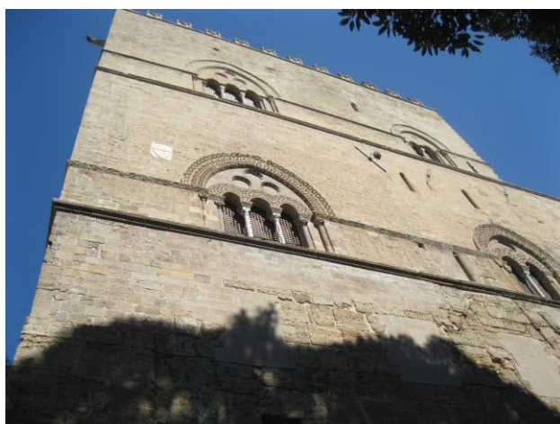
Figure 6 Palazzo Steri, site of five out of six FineCat symposium editions, photographed during FineCat 2013, on April 10, 2013.