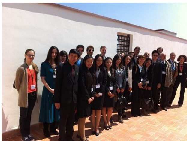
Figure 5 Some of the participants at FineCat 2013, Palermo, Palazzo Steri, April 10–11, 2013.