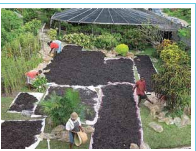
Figure 2. Vanilla pods drying in the sun in Madagascar, where Symrise opened an extraction facility in 2014.

Accordingly, large fragrance companies have started to invest in new plantations and new extraction plants using novel extraction technology, acquiring control of the whole value chain in the sourcing country. Symrise, for example, lately opened a large (3,500 m2) facility in Madagascar for making high quality vanilla extracts working directly with vanilla farmers (7,000 in 90 villages) in northeastern Madagascar in order to ensure the sourcing of natural vanilla as well as guarantee its high quality and seamless traceability (21).