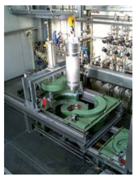
Figure 3. A section of the scCO2 extraction plant operated by NATECO2 in Germany's Wolnzach.

All this creates new room for the two cleanest extraction technologies, namely supercritical fluid extraction (SFE) and microwave-assisted extraction (MAE), whose applicative potential had remained largely unfulfilled.