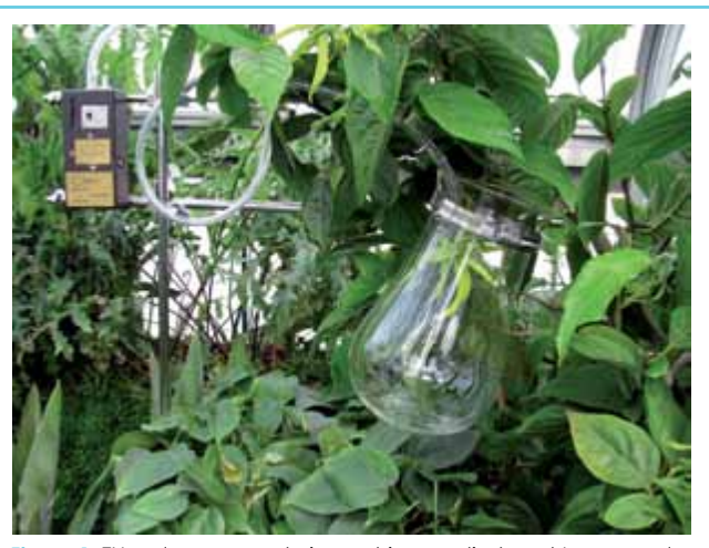
Figure 1. Thead space analysis machine on display at Longwood Gardens.

Fragrances are small volatile molecules with pleasant scent widely used in cosmetic, personal and home care products (3), adding scent to human body and living spaces, providing favorable effect on our emotional perception (4). The word perfume derives from "per fumum" (Latin for "through smoke"), as Romans learned that by throwing flowers, leaves, and aromatic resins onto burning coals, all these botanical species released their scents.