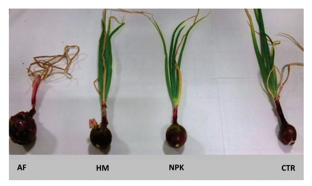
Figure 1. Tropea's red onion plant grown in soil fertilized with AnchoisFert (left), horse manure (HM), nitrogen:phosphorous:potassium (NPK), and in unfertilized soil (CTRL).

The analysis of cations and anions in red onion bulbs grown in pots for 3 months (maturation time) with the different fertilizers in the same amounts mentioned above revealed once again significant differences (Table 5, results expressed in milligram per gram DW).