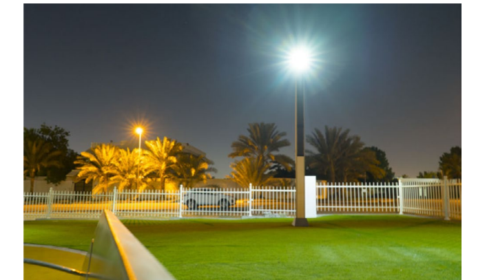
FIGURE 3 One of the solar street lighting systems with children's playgrounds installed by the Municipality of Dubai in 12 parks in the city's main residential areas.