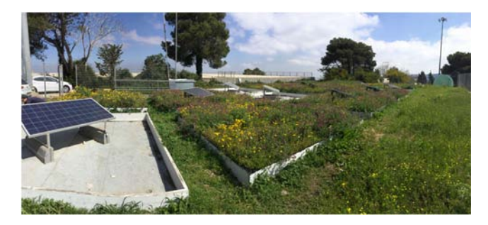
Figure 6. The PV modules on conventional and on green roof tested in 2016 and in 2017 at the University of Haifa (photograph courtesy of Professor Bracha Schindler).

Similar findings were reported by scholars in Singapore after comparing the temperature for a PV module on green and concrete roofs.<sup>[22]</sup> Again, no difference was observed between the