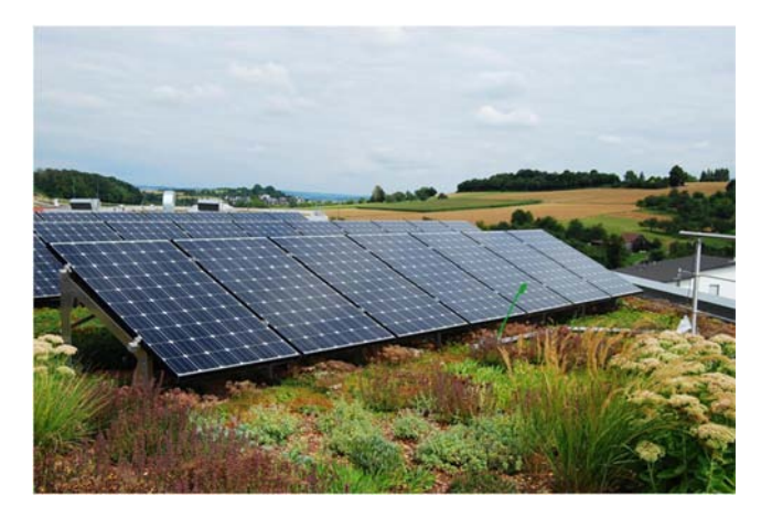
Figure 1. The green roof provides a superimposed load. There is no roof penetration, thanks to the superimposed load principle.

The green roof areas beneath and close to the PV array remained fully vegetated, whereas coverage in the exposed areas was patchy which is, the scholars noted, a typical condition in moisture-deprived plants exposed to high levels of direct solar irradiance (bottom of Figure 2).<sup>[16]</sup>