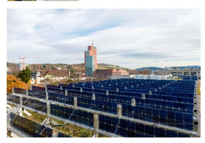
Figure 4. Aerial (top) and later (bottom) view of the 909 kW PV array on the rooftop of a building of Zurich University of Applied Sciences in Winterthur (photograph courtesy of T. Baumann and Zurich University of Applied Sciences).

Regular green roof substrate with normal green-leaved plants (Standard Green Roof, SGR)