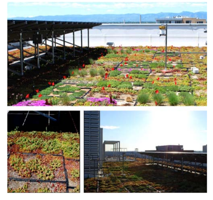
Figure 2. Effects of protection from the PV array on the green roof (top) where vegetation appears to have greater coverage (bottom left) in areas shaded from direct sunlight for a portion of each day (bottom right).