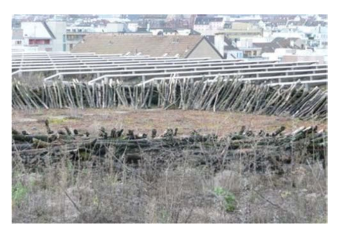
Figure 3. The solar green roof completed in 1999 on the Hall 1 of Messehalle Basel (after addition of organic matter and woody debris in 2008).

the general appearance) on the rooftop of a building of Zurich University of Applied Sciences in Winterthur.<sup>[11]</sup>