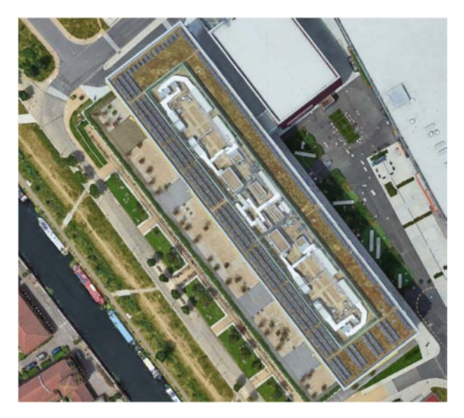
Figure 8. The four-storey London Olympics International Broadcast Centre hosts a 2500 m^2 green solar roof whose habitat attempts to mimic the open habitat of the Thames river corridor (photographs from Google Earth).

newly distributed generation energy framework that offers tangible and prolonged benefits in both developed and developing countries.