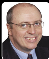
David A Leigh Supramolecular Chemistry University of Edinburgh, UK