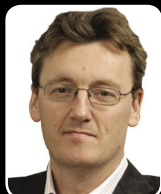
David MacMillan Editor-in-Chief Princeton University, USA